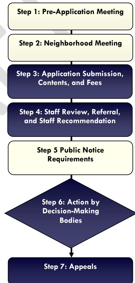
Figure 17.12-16: Waivers

Figure 17.12-16 shows the steps of the common development review procedures that apply in the review of applications for waivers. The common procedures are described in Section 17.12.040. Specific additions and modifications to the common review procedures are identified below.