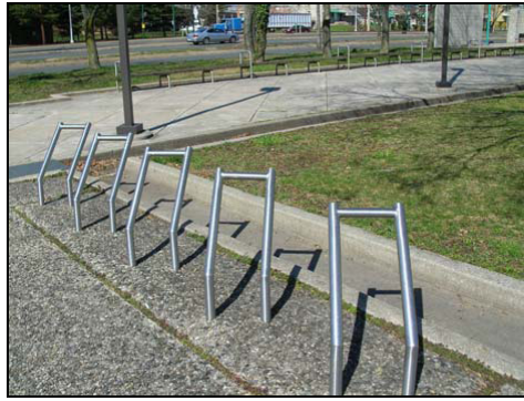
Fig. 17.24.040-D: Bicycle parking facilities