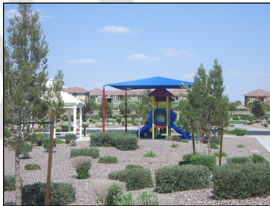
Fig. 17.24.060-D: Drought-tolerant plants and turf are required