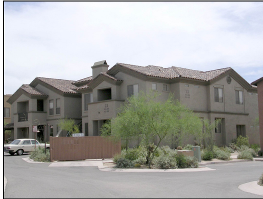
Fig. 17.24.060-E: Drought-tolerant landscaping used instead of turf grass