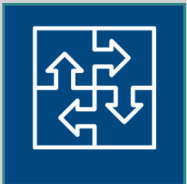
Continuity of Services

CMWorks commits to offer strong continuity of services. We understand this is an important service and if the CNLV is willing to commit to offer CMWorks a position for the FEB project, we will commit to ensure our professional(s) are available for the duration of the project. Many of our diverse team members can fulfill the roles and duties of an inspector and construction manager to meet the changing demands of each project and assist where services are needed. Further, CMWorks has local depth of staff to assist in part-time or full-time services as needed.