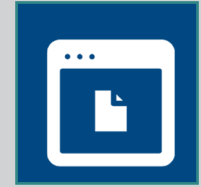
Document Control Specialists

CMWorks offers document control specialists who are skilled, trained, and experienced in construction. They assist our team members on a multitude of services and consistently add value due to their expertise while creating savings due to their lower billing rates.