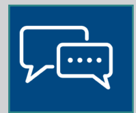
Communications & Communication Plan

Communication is critical to a good project management plan. As part of any good organization, clear and concise channels of communication must be established. For the CNLV, we will provide both effective verbal and written communication with CNLV, contractors, and stakeholders including those with diverse backgrounds. We know how to develop strong communication plans and can work with the CNLV project team to ensure clear communication is defined and implemented.