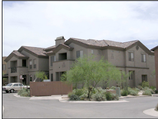
Fig. 17.24.060-E: Drought-tolerant landscaping used instead of turf grass