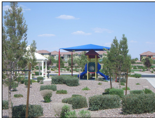
Fig. 17.24.060-D: Drought-tolerant plants and turf are required