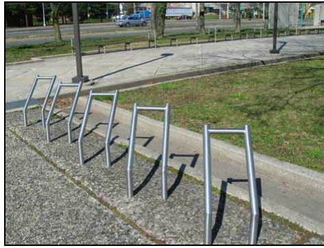
Fig. 17.24.040-D: Bicycle parking facilities