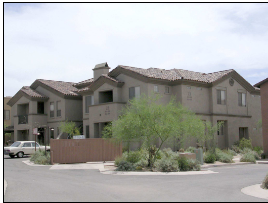
Fig. 17.24.060-E: Drought-tolerant landscaping used instead of turf grass