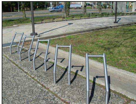
Fig. 17.24.040-D: Bicycle parking facilities