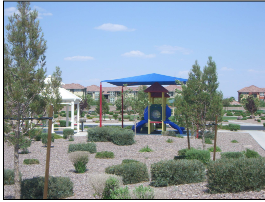
Fig. 17.24.060-D: Drought-tolerant plants and turf are required